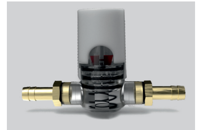
GazOkay® Standby Mode