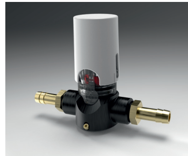
GazOkay® With Aluminum Wall-Table Bracket